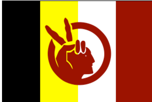
Flag of the American Indian Movement.